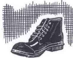
PACS, BOOTEES, AND WORK SHOES, less than 10 inches high. (Type 6)