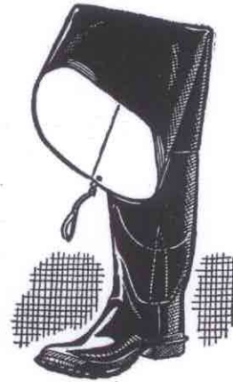
HIP-HEIGHT BOOTS. All hip, body, thigh, or sporting boots. (Type 1)