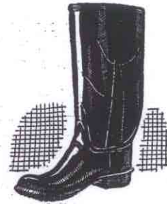
BELOW-KNEE-HEIGHT LIGHT BOOTS. (Type 4)