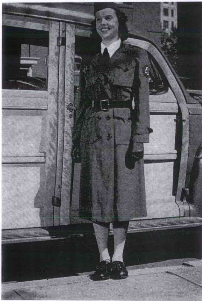
The New Lightweight Uniform

on Form 1567 from Area Offices. Extra dickies cost $1.00. The topcoat of the lightweight uniform costs under $30.00 and directions for ordering it are available at Area Offices.*