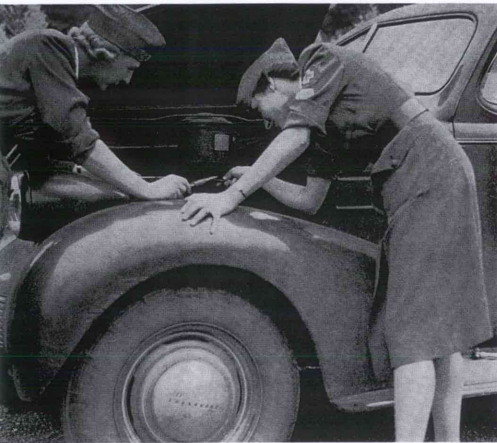
Motor Corps Members Repair Car

volunteer must have a regulation First Aid Kit (see EQUIPMENT).