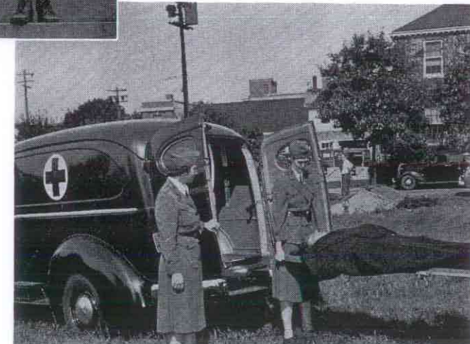
Caring for Accident Victims