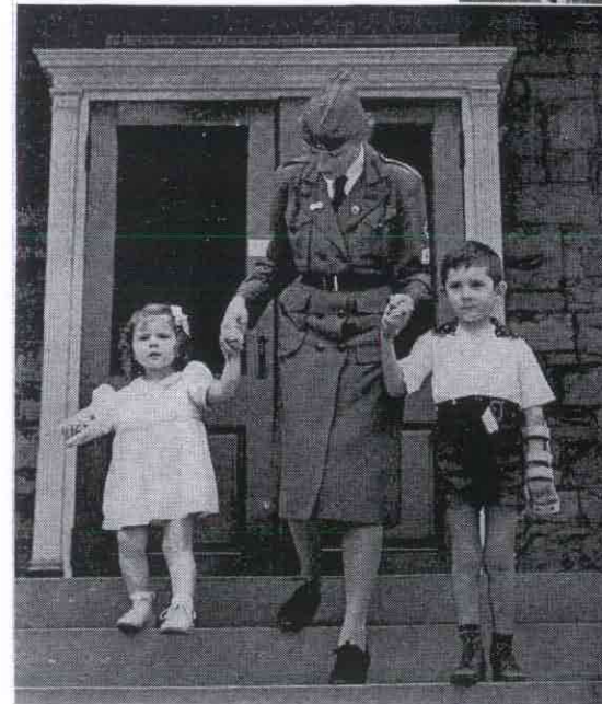
Taking Crippled Children to Hospital