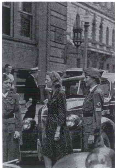
Transportation of Blood Donor

Completion of both the Standard and Advanced First Aid Courses is essential. These courses must be given by an instructor certified by National Headquarters. Thereafter, compulsory review must be provided by the Chapter. For details on courses, see First Aid Planning for Chapters (ARC 1052). In order to make practical use of this training, each