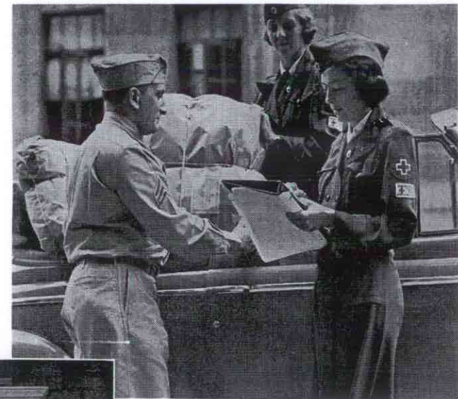
National Defense Work

The officers of a Motor Corps should consist of a Captain, an Adjutant, and such Lieutenants or Aides as the size of the Corps may require. If there is any objection to the use of military terms, the titles "Chairman" and "Vice Chairman" may be substituted. In addition to the general qualifications listed below for all Motor Corps members, these officers should have leadership ability, good judgment, and resourcefulness.