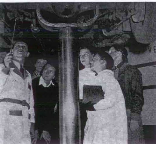
Instruction in Motor Mechanics