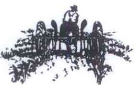
Cultivating 2 Rows