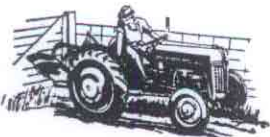
Working Tight Places