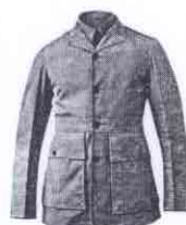
Style No. 2000.

Color; army o. d.; 3 1/2-inch brim; enameled ventilating eyelets in crown; one inch silk band with bow, bottle green for the Agricultural units, dark maroon for the Industrial; order by size.