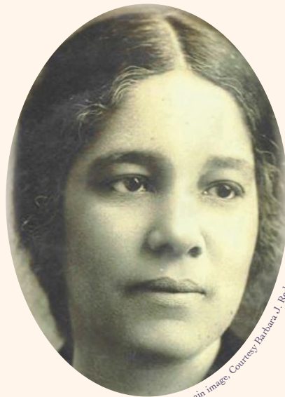
Public domain image, Courtesy Barbara J. Reckwinc.

OREGON STATE ARCHIVES https://sos.oregon.gov/archives