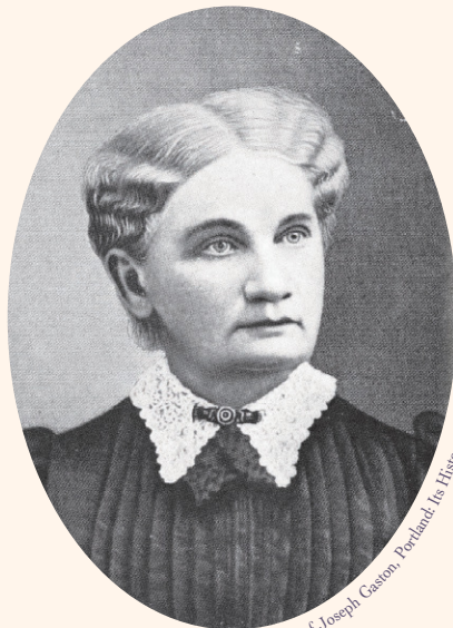
Courtesy of Joseph Gaston, Portland: Its History and Builders (vol. 2), p. 734.

OREGON STATE ARCHIVES https://sos.oregon.gov/archives